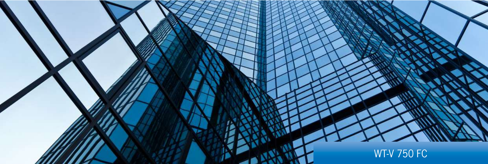
WT-V 750 FC