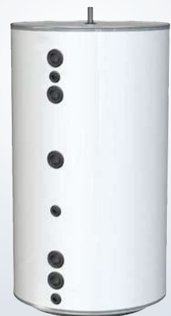
WT-V 750 FC DN80

The Thermia series includes the following volume tanks: WT-V 100, WT-V 200, WT-V 300, WT-V 500, WT-V 750, WT-V 1000 - as well as WT-V 500 FC, WT-V 750 FC and WT-V 1000 FC. The product names refer to the tank volume in liters.